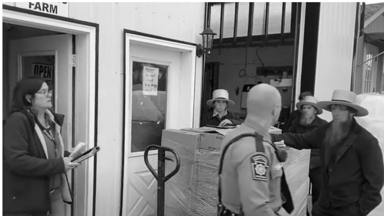
YouTube The Lancaster Patriot Video Screenshot