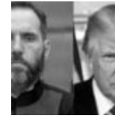
JUST IN: Appeals Court Denies Twitter/X Challenge to Special Counsel's Secret Trump Search Warrant;